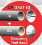
CP GRAT-EX ID + OD Deburring Tool Head